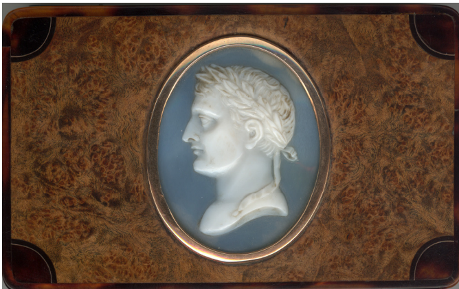
A snuffbox representing Napoleon as a Caesar

An identical ambition was behind the decision to create a Temple of Glory at the Madeleine, celebrating the memory of the brilliant exploits of the French Army. On December 2, 1806, indeed, the Emperor in effect accepted a metamorphosis of the church begun under Louis XV into a temple commemorating heroism. The exterior frontispiece contained the laconic dedication: "The Emperor Napoleon to the soldiers of the Grand Army." On the inside, by contrast, there were numerous inscriptions, busts, and statues. In this monument, Napoleon ostensibly separated himself from the kings of France by consenting to share the honors of glory with those who had followed him on the battlefield, from simple soldiers to marshals. But this democratization of honors was not absolute, and the honorific hierarchy remained traditional and not democratic: it was done according to ranks and not exploits. So what? Napoleon's idea was that posterity might marvel at a monument "made by him for national heroes." 33