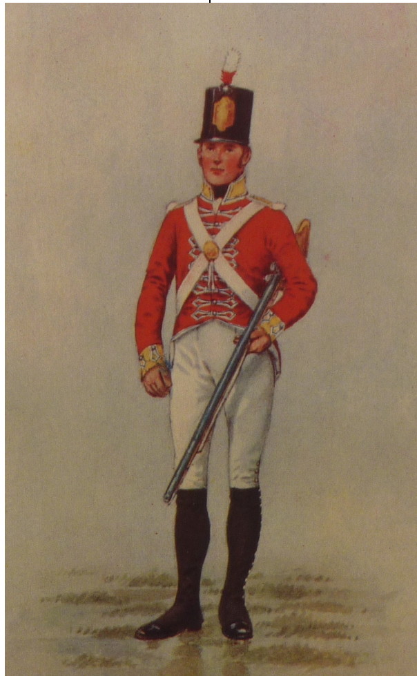
30th Foot, Private, 1806

active service could prove a liability when sent into action. And it is worth remembering that most of these second battalions formed part of Wellington's 'infamous' army during the Waterloo campaign. The junior battalions that served with Wellington in the Peninsula, however, proved to be units of a very different caliber. An examination of just one two-battalion infantry regiment of the line, the 30 th , or Cambridgeshire, not only demonstrates what a junior battalion could achieve but also allows us to explore the practical relationship between the different battalions of the same regiment.