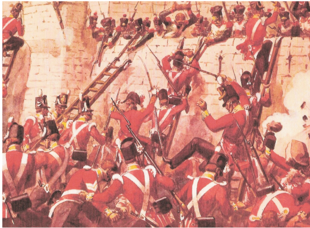
The 2/30 th escalading the San Vincente bastion

thirty, a reminder that the junior battalion still had more of the superannuated soldiers in its ranks. 13