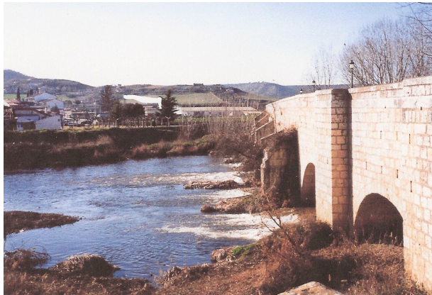
The bridge at Villamuriel

the fifth division to hold a position so that the rest of the Anglo-Portuguese army could retreat in safety. This experience, combined with the well-trained Irish militia volunteers, meant that the second battalion was the fighting battalion, in practice, even if not according to theory.