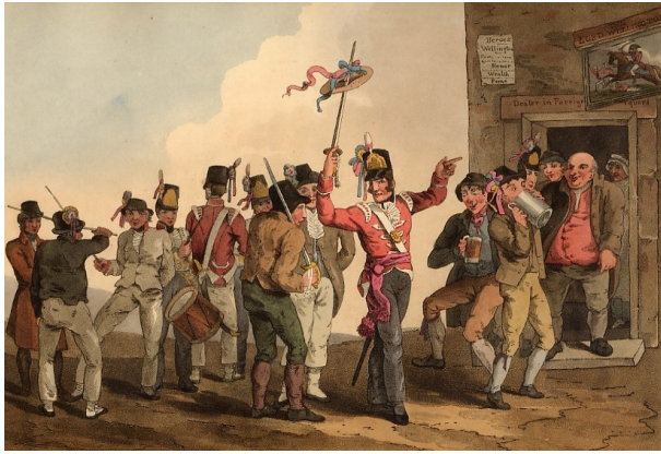
A recruiting party of the 33rd Regiment, The Havacakes

Practice, however, is generally more interesting and more complex than theory. To start with, if we search for the theoretical arrangement during the Napoleonic period of the wars, we find twenty-two regiments that fitted the prescribed pattern, which means that fifty-one did not, including battalions added after 1805. 5 In other words, as the scope of the war spread the theoretical supposition that the first battalion would be sent abroad while the second battalion stayed at home proved impossible to sustain for more than two-thirds of the multi-battalion regiments. As a result, the complementary nature of the relationship between senior and junior battalions was also disrupted. For example, Wellington's infantry (excluding the Guards regiments) at Salamanca in July 1812 consisted of twenty-nine senior battalions, sixteen junior battalions, including detachments from the 2/95 th and 3/95 th and the dispersed companies of the 5/60 th , and four single-battalion corps.