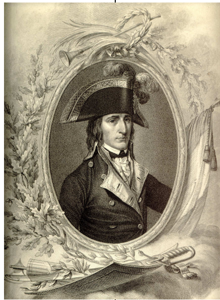
Napoleon by Ledru

French protection in 1801, but on 11 September 1802, Napoleon annexed Piedmont to France, dividing it into six new departments: Doire, Marengo, Po, Sesia, Stura, and Tanaro. 6 This act disappointed leaders of the Italian republic who had hoped that Piedmont would be joined to their new state. The annexation of Piedmont was the most significant move in terms of consolidating France's position in Italy during this phase. Aside from its economic wealth, possession of Piedmont gave Napoleon